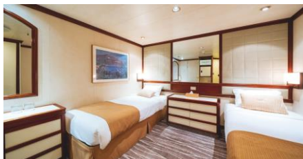
內艙房 Inside Cabin /