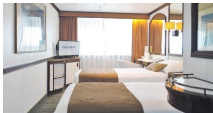
海景艙房 Outside cabin

Size 面積：14 m 2 (II - Plus II) / 16 m 2 (Plus I)