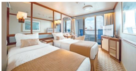
露台艙房 Balcony Cabin