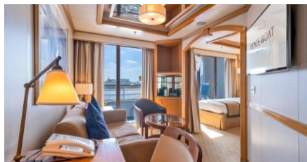
迷你套房 Junior Suite